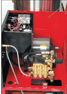
Belt-driven Hotsy pump with industrial-grade Baldor motor.