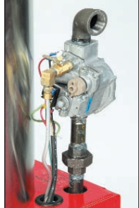
Elevated electronic gas control.