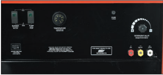
Control panel provides easy access to low-voltage safety switches.