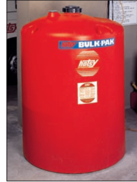
Optional bulk tank saves money and simplifies detergent handling and re-ordering.

With their easy adaptability, the 1800 Series models are prime candidates for Hotsy's full line of accessories. You can custom tailor the washer to your specific requirements, making your cleaning jobs faster, easier and better. Choose from extra hose lengths, hose reels, wand extensions, quick couplers, downstream detergent injector, foam applicator, wet sandblaster, rotating brush and more.