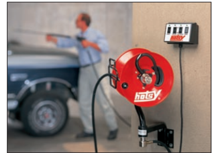
Optional hose reels keep hoses neatly stored for a safer environment.

The 1800 Series pressure washers are ideal for use in wash bays as well as remote applications. All models are ETL approved to UL 1776 and conform to CSA Standards to meet code requirements.